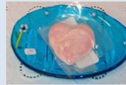
Soap by Juanita Cates and fused glass soap dish.