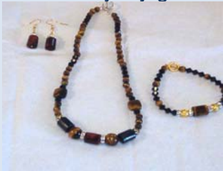
Bren Dismuke's crystal jewelry