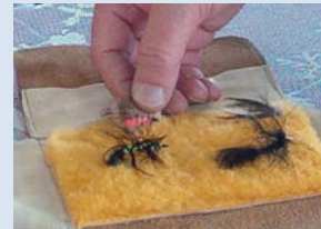
Fly wallets of Tom Seamons.