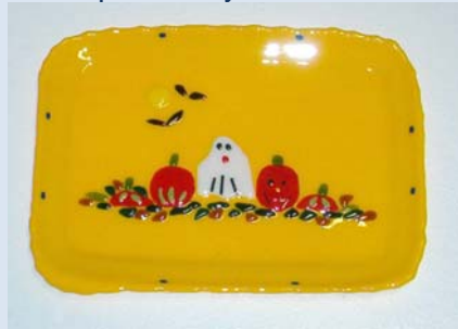
"Hiding in the Pumpkin Patch"

It wouldn't be Halloween without creating a Halloween Specialty Item. This year I developed a tray called: