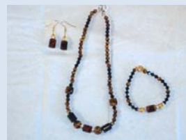
Crystal jewelry by Bren Dismukes

More great gift ideas from our Gallery of Artisans!