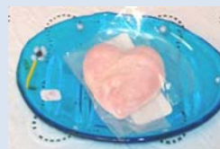
Soap by Juanita Cates and fused glass soap dish.