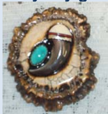
Belt Buckle inlay by "Bear"